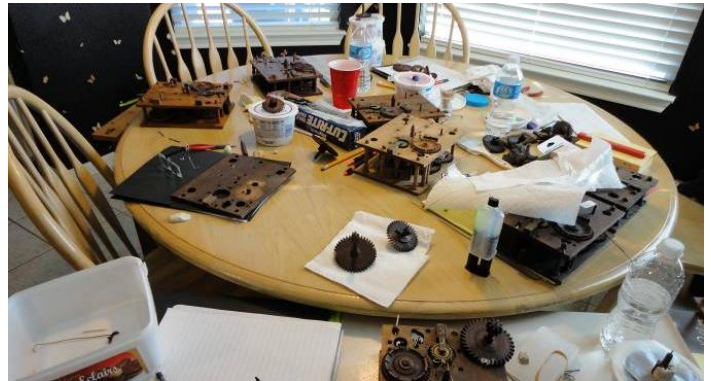
Waiting for the clock elves to help