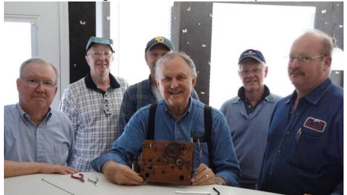
Another successful rescue