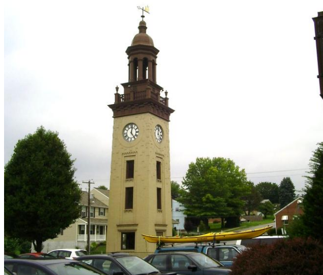
Clock tower at NAWCC offices in Columbia