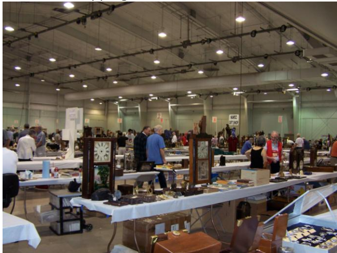
The mart room

Friday was the first day of the mart. Our first reaction was "Wow!" The lobby was backed up with people waiting for the doors to open. The mart room was huge, larger than any of the regionals we had been to. For Bob there was also some frustration, since he couldn't get everything he wanted as we flew and it would've cost a fortune in shipping!